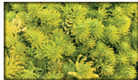
Sedum Acre 'Aureum'