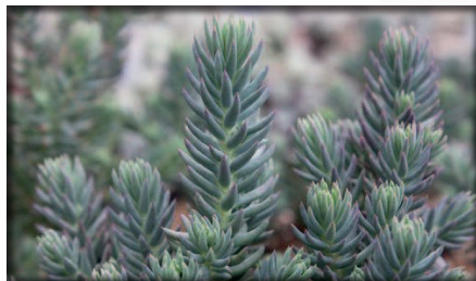
Petrosedum (AKA Sedum) Subsp. Rupestre 'Blue Spruce'