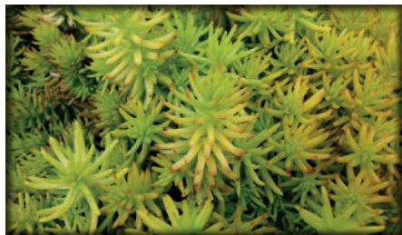
Petrosedum (AKA Sedum) Subsp. Rupestre 'Angelina'